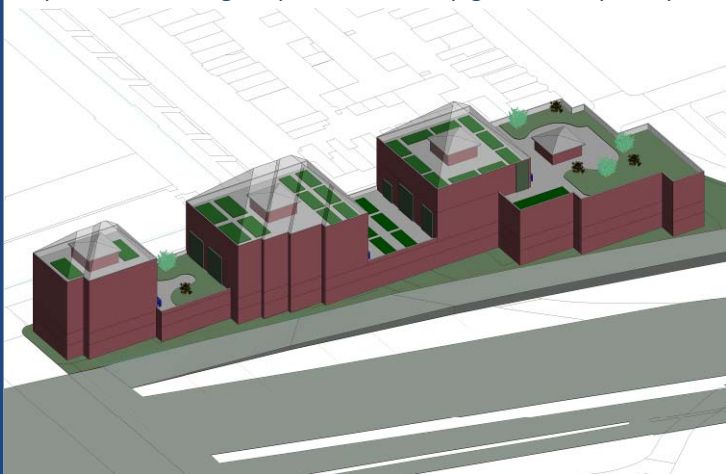
Aerial oblique view to the north from the Southeast Freeway (10 th St. SE at left, 8 th St. SE at right)

Updated renderings of potential rooftop gardens atop one potential concept for a replacement building at the site of MBW Building 20